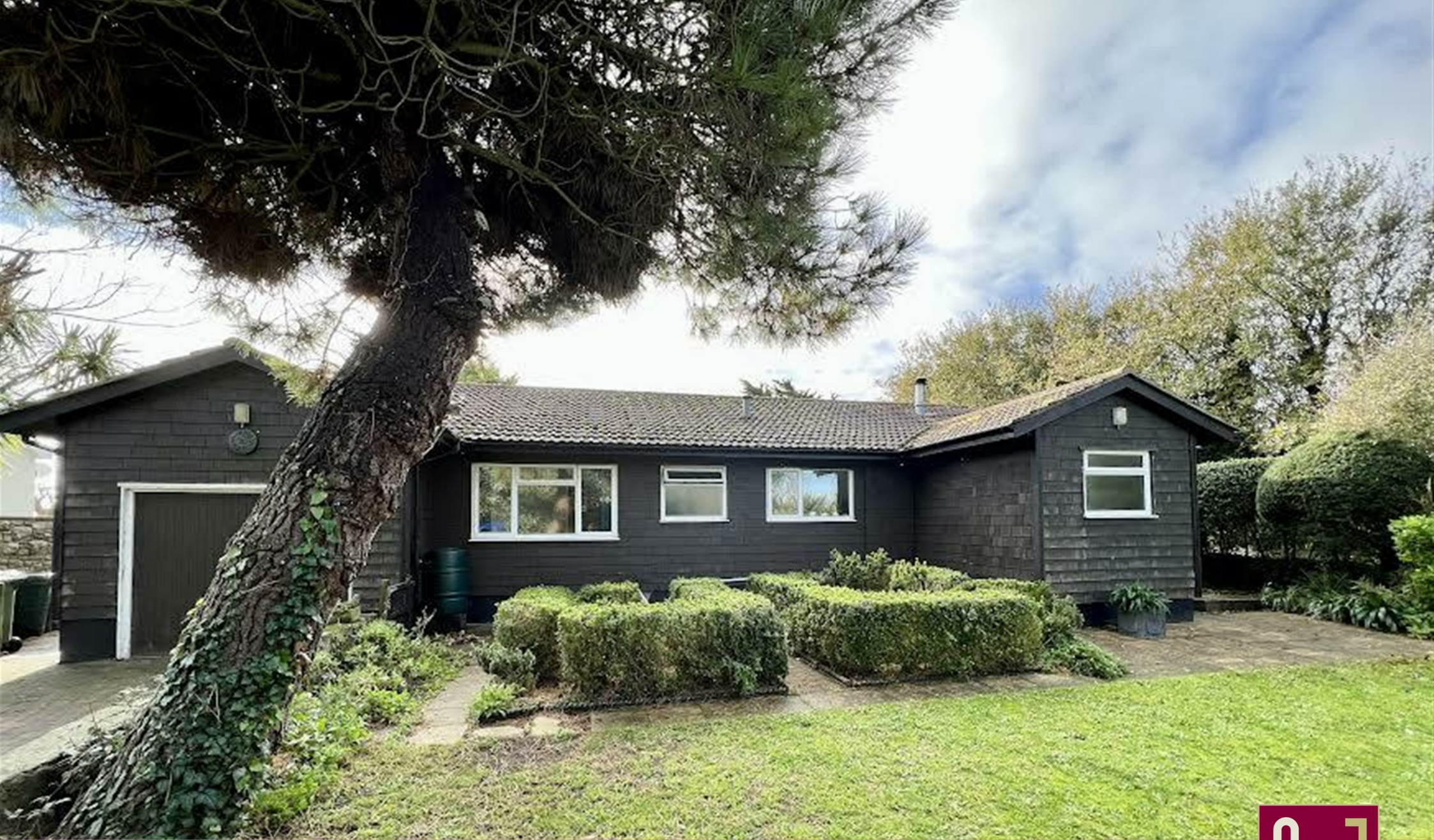
Clair de Lune, Alderney €395,000